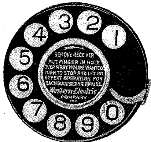
Fig. 1.—A dial of the type in use in 1917 with only numbers beneath the finger holes.

dial, but the letters were used merely as a substitute for digits—generally because it was easier to remember a number consisting of letters and digits than one of digits only. In the larger cities where there was more than one central office, each office was designated by a one- or two-digit number listed in the directory ahead of the subscriber's line number, and thus the complete number would include five or six digits. The panel system, however, had been designed for the very large metropolitan areas where