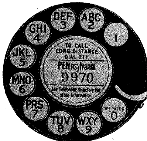
Fig. 2.—A dial that came into use in the Bell System as a result of Blauvelt's invention.

With the earlier dial systems, the dials for the most part carried only the ten digits from 0 to 9, inclusive. Sometimes a single letter was placed with each digit on the